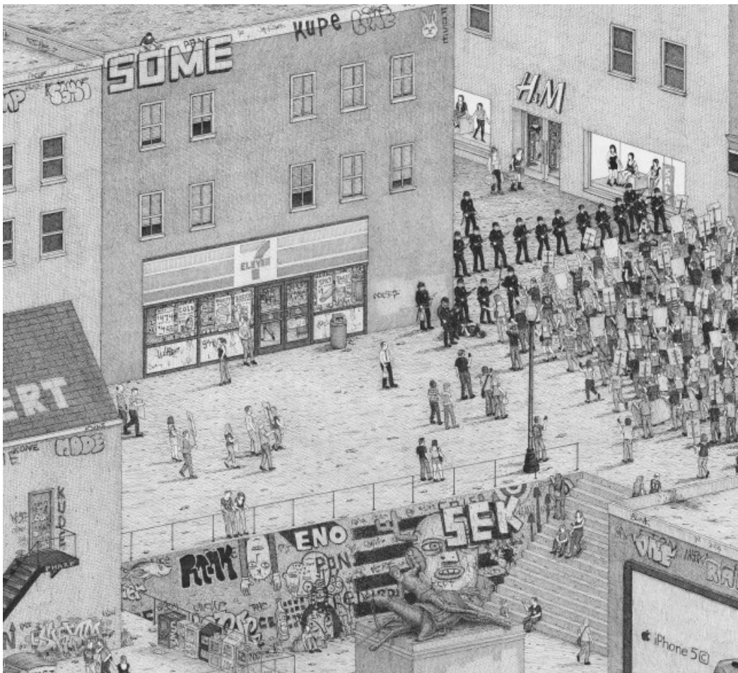
Ben Tolman - „Some“, detail, ink on paper, 2014. (@Ben Tolman, Courtesy of the author)

As the public space of a city is a key place of conflict of economical and political paradigms of the society the task is to respond to the question of architecture's ability (as a specific discipline) to intervene in this process. What is actually the support and function of architecture in times of growing economical and political instability and its repercussions on public space? Is architecture forced to rely on its own knowledge, its own form in these times, or, and how to include other disciplines in co-creating the public sphere? Or is this a hidden opportunity to liberate architecture of superfluous narratives? In the end, to what extent can architectural form play the role of the universal form, a place in which conditions for creating an Event are formed, in which interests and conflicts are mitigated and which constitutes a public sphere and a physical space for all users? Scenarios are to be created of human interaction and their manifestations in public space of a city within the European context.