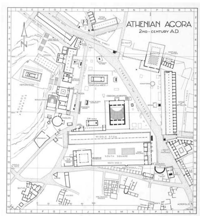
Athenian Agora, 2nd century AD

Cities around Europe are grounds of ever intensifying conflict between two paradigms. On the one hand side we are witnesses of urban development as an infrastructure of global capital, and on the other hand side the traditional idea of maintaining the concept of a city as a political place in which sovereignty thrives on public squares. While the first paradigm sees the private interests necessarily transform into public ones, the other looks upon public sphere as the last defensive line against gentrification. Architecture, in this case acts as a discipline providing the spatial and physical framework for this conflict of interests in public space.