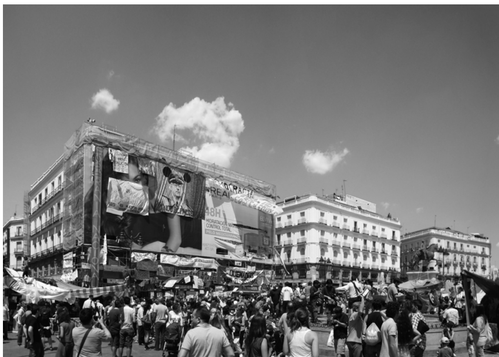
Puerta de sol, Madrid, svibanj 2011.

Tako javni prostor nosi ponešto od jednog - privatnog, domaćeg ( oikos ) i ponešto od drugog - javnog ( polis ). Drugim riječima, upravo je javna sfera to univerzalno polje u koje pojedinac ulaže svoje interese i u kojem se prepoznaje kao izmješten iz svoje svakodnevne uloge, odnosno riječima Slavoj Žižeka: „Univerzalnost za sebe samu nije samo eksterna (ili iznad) individualnog konteksta: upisana je u njega, utječe na njega iznutra, tako da identitet individualnog je podijeljen u njegov individualni i univerzalni aspekt“